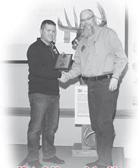
IBA Officer of the Year