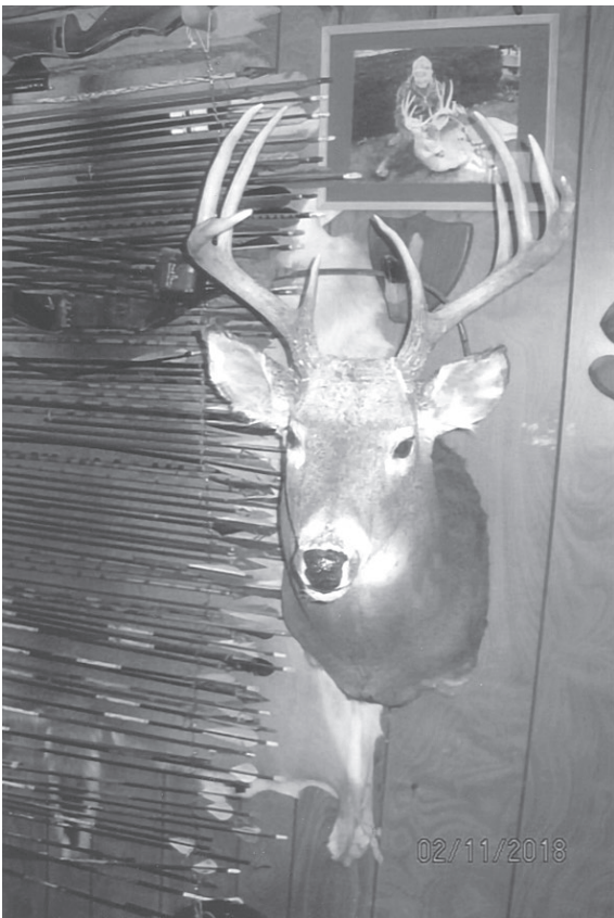
Jeff Weller buck – 9 pt ~ 195 lbs ~ shot on Oct 22, 2017 ~ 15 yd shot and ran only 50 yds