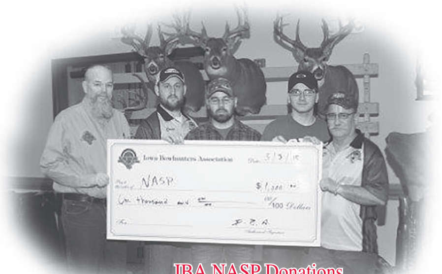
IBA NASP Donations