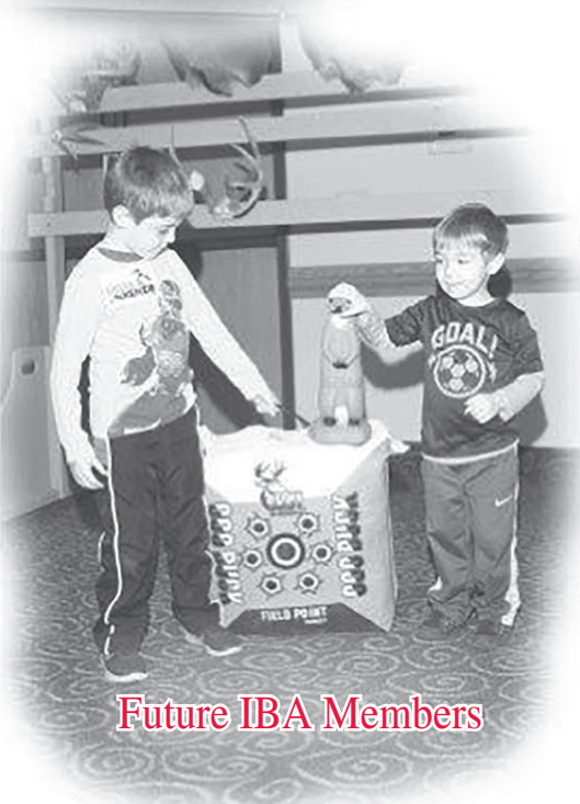
Future IBA Members